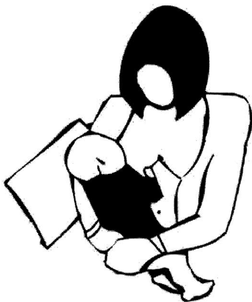
Figure 2. Breastfeeding: face-to-face and belly-to-belly.

If the room is cold, you can use the hot water bottle to help keep the baby warm. Just wrap the warm bottle in a blanket and place it next to the baby's back.